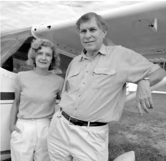
The editors — still comfortable with single-engine Cessnas.